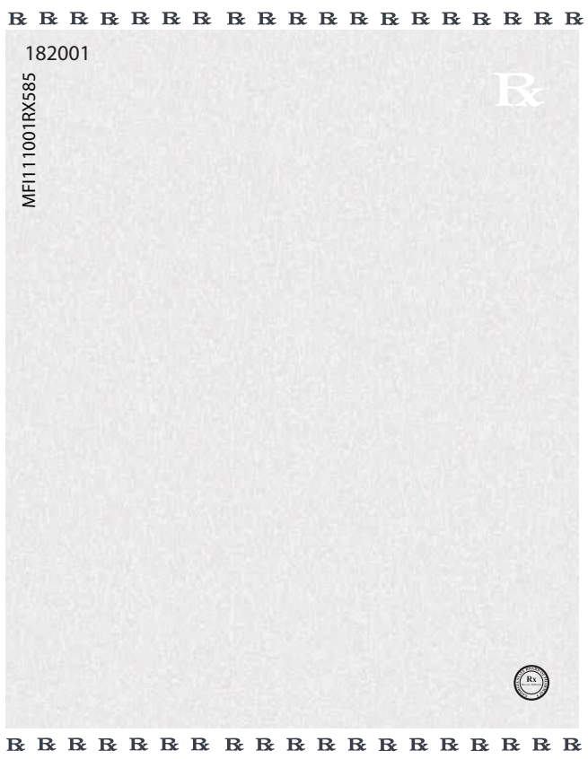
Front - RX580 Full Sheet